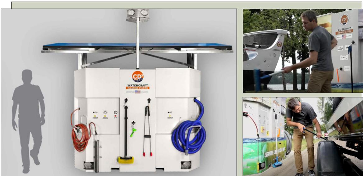
The CD3 Watercraft Cleaning Station. Public use research has shown people use the cleaning stations even when launch inspectors are not present; users found the stations easy and fast to use, often in less than 5 minutes; and, users would plan to use the cleaning station again. In a pilot study of 38,000 cleaning stations in 22 states, on average each cleaning station saw 678 uses per month per system. CD3 systems are solar powered; their use is monitored.

In summer 2021, over 19,000 boats were recorded entering Balsam Lake at Town Bay and the Highway 46 boat launches. An additional 400 boats were recorded entering at the East Balsam launch. This volume does not include the number of boat launches that occur when monitors are off duty.