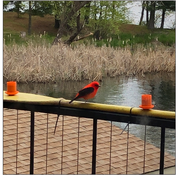
A breeding male Scarlet Tanager, unmistakable, brilliant red with black wings and tail. Females are olive-yellow with darker olive wings and tails. Learn more at allaboutbirds.org .

THANK YOU for your participation and support. Enjoy the summer season. ● — Tom Kelly