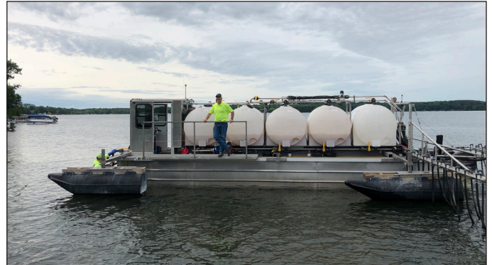
The HAB barge on East Balsam

The second alum treatment is scheduled for June 2022. After completion of the second alum treatment 60 percent of the prescribed treatment will have been completed. ●