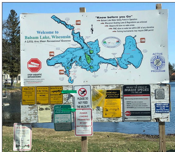
Signage at Balsam's Town Bay landing.

In addition Polk County has enacted a new ordinance that requires anyone launching a boat to utilize a cleaning station when available at the landing. BLPRD is investigating the possibility of installing cleaning stations at the landings on Balsam Lake. The cleaning stations are self-service and vary in size and price. The cost is supplemented by the Wisconsin DNR via grants. See page 3. ●