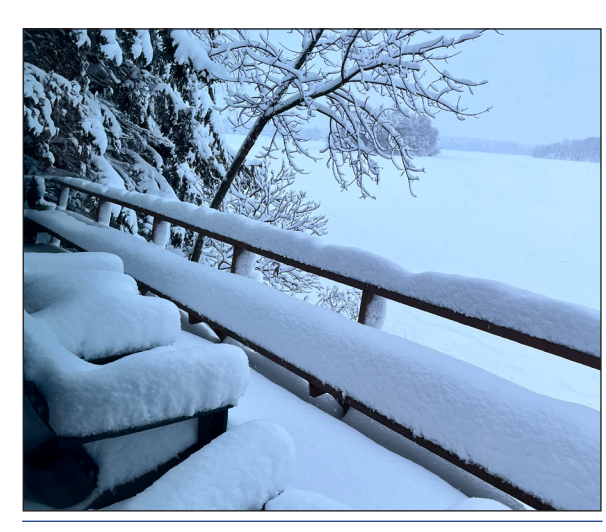
Last winter's heavy snowfall may have slowed the growth of Curly-leaf pondweed under the ice.

THANK YOU for your participation and support. Enjoy the summer season.