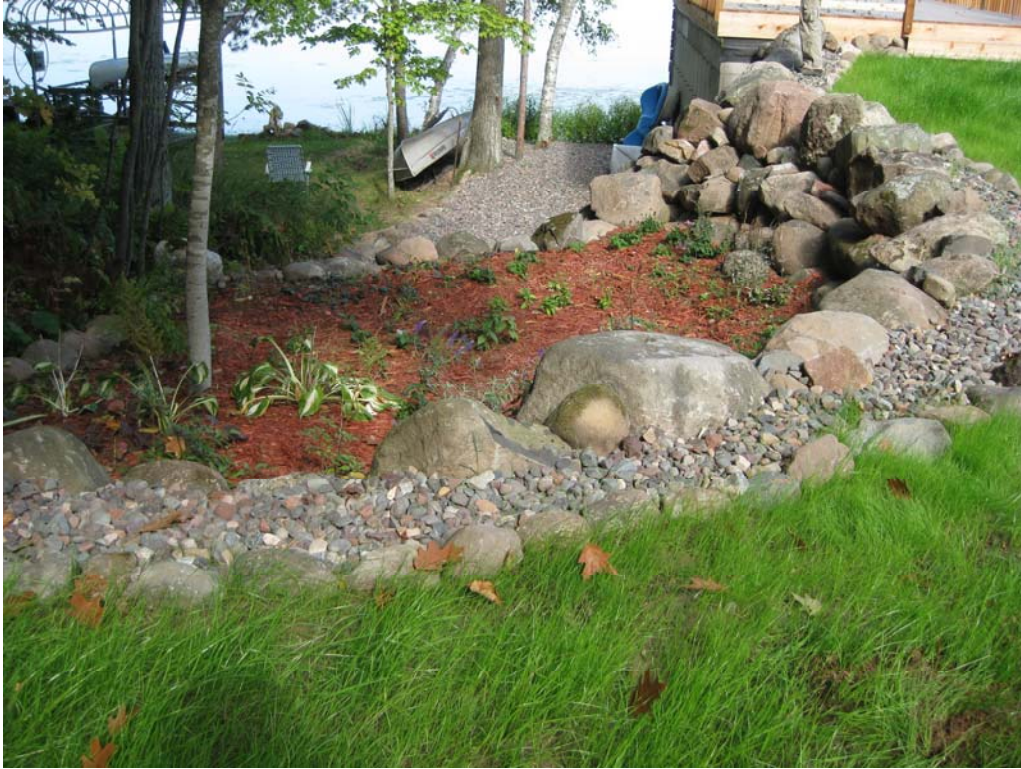
RAIN GARDEN 2