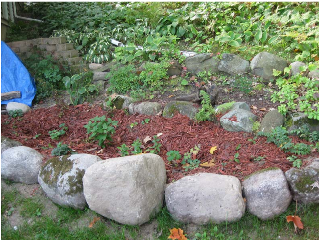
RAIN GARDEN 1

SOLUTION: Two rain gardens were built—one to catch the water from one of the house's downspouts and one to catch the water from the new boathouse. They were planted with deep-rooted native species and lined with mulch. In order to increase the infiltration capacity of the gardens' clayey soils, sand was hauled in to replace some of the underlying clay.