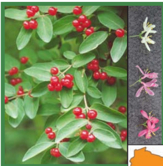
Eurasian bush honeysuckle