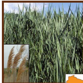
Phragmites (Common reed)