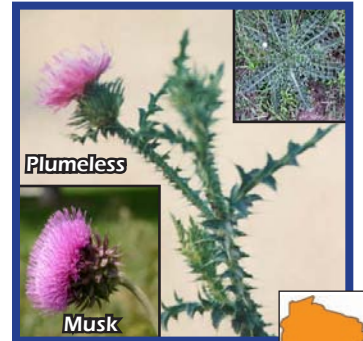
Musk & Plumeless thistle