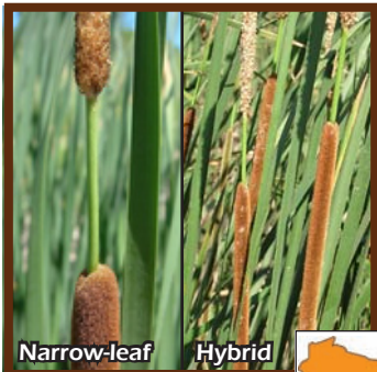
Narrow-leaf & Hybrid cattail