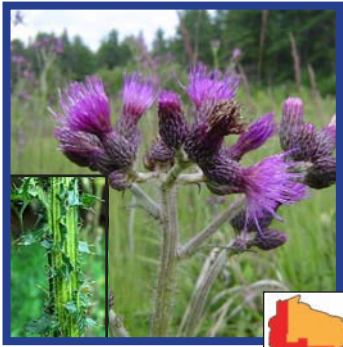
European marsh thistle