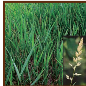
Reed canary grass