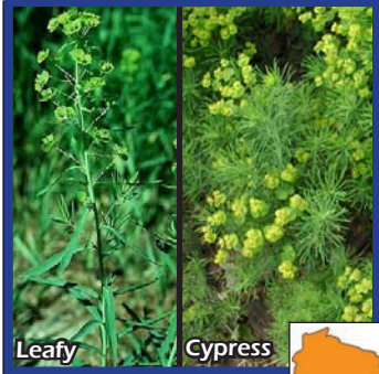
Leafy & Cypress spurge