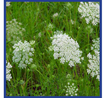
Queen Anne's lace